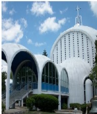
St. George Greek Orthodox Cathedral