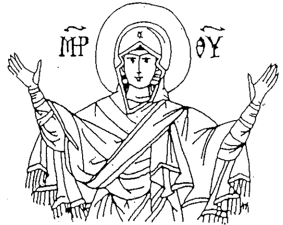
NAMES FOR HEALTH ΥΠΕΡ ΥΓΕΙΑΣ

Please write the baptismal names of those people you wish remembered and return this list to the Church office or give it to Father.