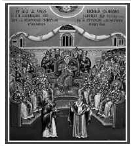
Fathers of the 4th Ecumenical Council

At times in church history, councils of all of the bishops in the church were called. All the bishops were not able to attend these councils, of course, and not all such councils were automatically approved and accepted by the Church in its Holy Tradition. In the Orthodox Church only seven such councils, some of which were actually quite small in terms of the number of bishops attending, have received the universal approval of the entire Church in all times and places. These councils have been termed the Seven Ecumenical Councils.