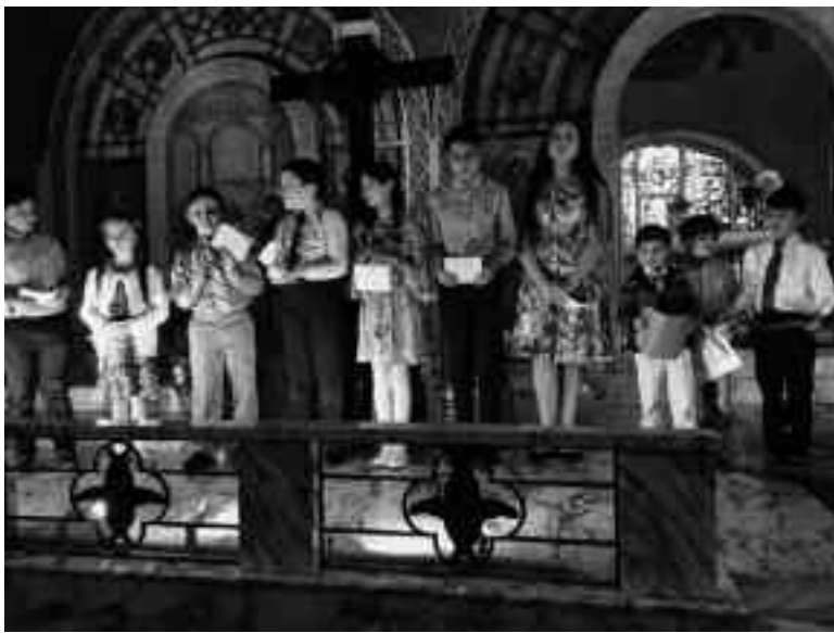
Outstanding Attendance Awards