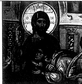
Saint John and our Lord, Jesus Christ

Have you ever been scared of somebody important? Maybe you were a little scared to talk to your teacher on the first day of school. Or maybe you met somebody famous and couldn't think of a word to say to him or her. Sometimes talking to an important person might make us feel shy or scared!